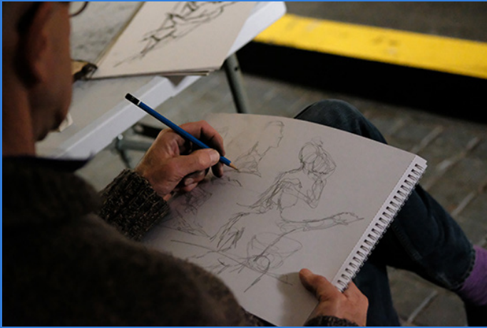
Life drawing workshop